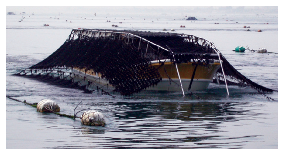
When harvesting red seaweed, specialized boats go under the nori nets. The Porphyra yezoensis is processed into wrappers for sushi rolls.

Part I. Lesser-Known Species Group Tops Mariculture Output